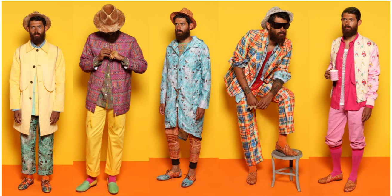
Images: Agi&Sam SS12